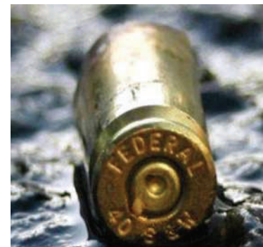
Federal .40 Cal